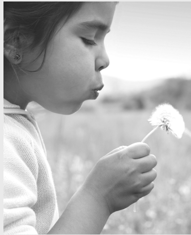
The Marge Clark Education Fund benefits Warren County Children by expanding their horizons through education.